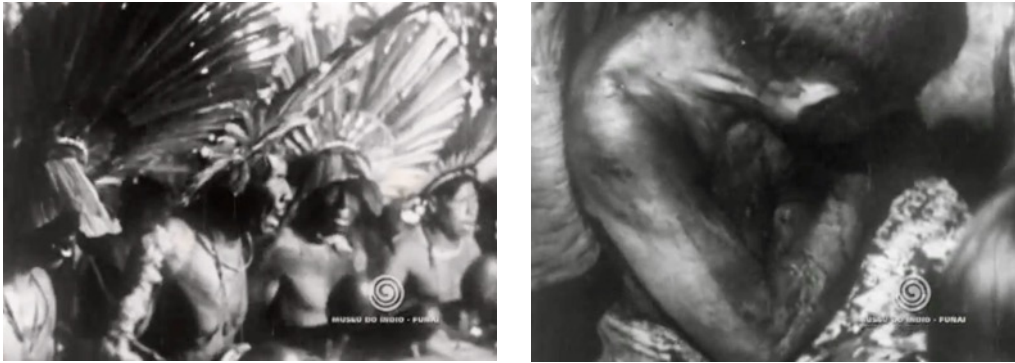
Images 41-42: Led by The Elder, the singing becomes more intense as an elderly woman cradles a basket containing the bones of her deceased relative.

But at this point, both this Act and the footage as a whole suddenly comes to an abrupt end.