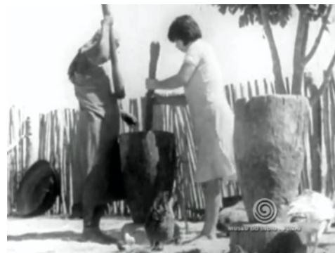
Images 9-10: The future for indigenous people? Frame grabs.