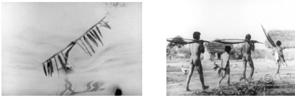
Images 11-12: The ritual bow suggests that the fishing expedition has a ceremonial purpose. Later, The Boy arrives at Pobore with the fishermen, still carrying his ceremonial bow. Frame grabs.

But this is for the future, and the film now moves on to an idyllic scene in which the indigenous children head off in a large canoe and are shown at a bathing place upriver. This scene is quickly followed by another in which The Boy is ferried downstream by the same elderly canoeist as we saw in the opening sequence in order to take part in a fish poisoning. This scene is very brief, but it is set up by an intriguing shot in which The Boy swims across a stream holding a bow out of the water. This is no ordinary bow, however: rather it is a ceremonial bow, as indicated by the feathers dangling down from it (Image 11). This shot would appear to anticipate the principal theme of the film since it seems to be indicating that the fishing expedition has a ceremonial purpose, i.e. that it is the fishing expedition that customarily takes place prior to a funeral ceremony (and with which Luiz Thomaz Reis's film opens at some length).