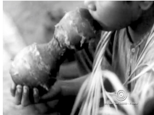
Images 29-30: The powari-aroe (left), the voice of a deceased relative; the pana , the voice of the ancestral spirit Itubore (right).

The second Act concludes with a sequence of men drinking from large gourds. What they are drinking is noa kuru , that is, water mixed with white tabatinga clay and sweetened with honey or grated palm heart – the preferred drink of the aroe . Finally, there is a shot of a group of women who are observing the event, the first time that women have been shown participating as a collectivity in the ceremony (as opposed to their presence as individual mourners, or as gravediggers). This is indeed the normal order of events at a Bororo funeral since it is only after the men have begun to refresh themselves with noa kuru that women become collectively involved (Images 31-32).