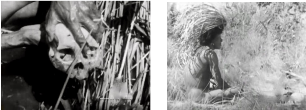
Images 33-34: After the skull and other bones have all been very carefully washed, the skull (bottom right) is dried out next to a fire. Frame grabs.

preserved. There is then a scene in which a young man, wearing a remarkable headdress, is shown sitting by a skull. This has been placed next to a smouldering fire to dry it out (Images 33-34). A considerable number of men are clearly involved in this process, some of whom are wearing Western clothing. There are even a number of boys. But although there are some fleeting shots of The Elder, there is no sign of The Boy.