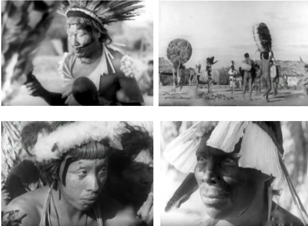
Images 25-26 (above): the singing of bacororo and the mariddo dancing. Images 27-28 (below): this 'Act' features a variety of headdresses, including that of the aroe maiwu , right, with a feather visor hiding the eyes. Frame grabs.

There are also other manifestations of the presence of the aroe , for example, in the close-up shot of a young man playing a powari-aroe , the small gourd mounted with a reed that functions as a musical instrument evoking the voice of a particular deceased relative. Another close-up shows a four-chambered pana , a sort of trumpet made from gourds glued together with resin. This is thought to reproduce the voice of Itubore, the ancestral spirit that rules over the eastern part of the Bororo village. A two-chambered version of the pana is also shown being played (Images 29-30).