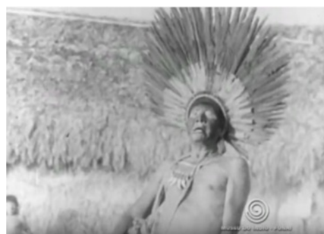
Images 21-22: Ancestral spirits arrive (left) while a man wearing a pariko headdress (right) makes a dramatic statement of his grief while striking a jaguar skin on the ground. Frame grabs.