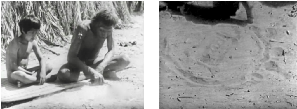
Images 13-14: The Elder explains the typical Bororo village layout to The Boy – rectangular ceremonial house in the centre, matrilineal clan houses on the periphery. Frame grabs.

counterpoint to the scene at the school, where the children do not learn about Bororo culture.