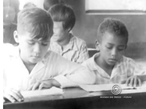
Images 7-8: Brazilian “racial democracy” in the schoolroom: indigenous, White and Black children sit side-by-side. Frame-grabs.