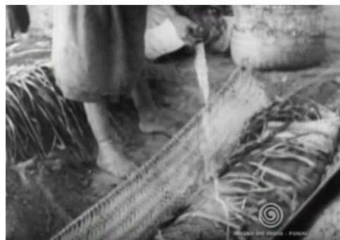
Images 23-24: The corpse is lowered into its grave and water is decanted over it to speed up its decomposition. Frame grabs.

These first burials are followed by the singing of bacororo chants around the graveside by men wearing pariko headdresses, shaking large maracas and dancing in the characteristic Bororo manner, jumping up and down. There is then a very well-executed sequence of the competitive dancing with the mariddo , (also a prominent feature of both the Reis and Lévi-Strauss films). Intercut with these dancing sequences, there are many fine portraits of those attending the ceremony, as well as perceptive shots of ethnographic detail. The latter include the impressive range of headdresses worn by the participants. One of these identifies the wearer as the aroe maiwu , the representative of the deceased's spirit, since it incorporates a visor of long yellow feathers covering his face and thereby symbolically hiding his identity (Image 28).