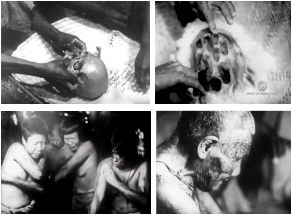
Images 35-36 (above): The skulls are painted with annatto and decorated with feathers; Images 37-38 (below): female relatives wail and lacerate themselves, including an elderly woman who appears to be the widow of Cadete. Frame grabs.

The Act begins with a series of shots that cut back and forth between the decoration of the skulls of the deceased (Images 35-36), and the highly dramatic scenes of their female relatives scarifying themselves with dogfish teeth, lacerating their arms, bodies and even faces, wailing for the dead in a display of excruciating pain (Image 37). Among the mourners is an elderly woman who appears to be the same person whom we saw at the beginning of Act 2 and whom we presumed to be Cadete's widow. Her face is covered in blood from scarification, and she is both crying and chanting (Image 38).