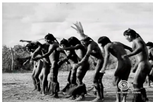
Images 2-3: The opening sequence of Os Carajá (1947). A formal portrait and a dance performed for the camera. Frame-grabs.