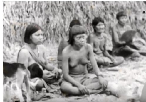
Images 31-32: A man refreshes himself with noa kuru , the preferred drink of aroe ; after this point, women become collectively involved in the ceremony. Frame grabs.

Yet although this Act is extremely rich ethnographically, there are also some very significant absences. One of these concerns the performances whereby dancers demonstrate by their dress or form of movement that they are embodiments of particular ancestral spirits. There are a number of these performances in the Reis film, and to a limited extent even in