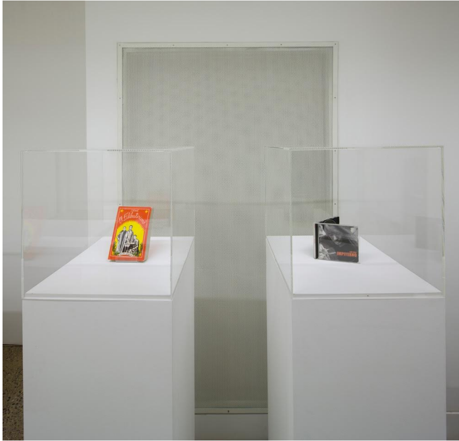
Image 2: Display of El Filibusterismo and a CD of Lav Diaz's music in the Discourse Space of Lav Diaz: Journeys .

Lav Diaz: Journeys culminated with a symposium and a theatrical screening programme. The symposium aimed to feature current scholarly research and curatorial propositions on Diaz's works, acknowledging the importance of cinephile critics, researchers, and practitioners who straddle an institutional foothold with participation in voluntary work building alternative circuits and cultures of film and art. As one of the first academic events addressing Diaz's films and artistic practice, the range of speakers invited to the symposium was also intended to signal some preliminary directions for broadening discussions of Diaz's film aesthetics and relevant contexts for understanding and appraising them. While the symposium encapsulated the valuing of research-informed discourse in engaging with Diaz's works, the exhibition ended with an auratic event: a one-off theatrical screening of Batang West Side in a cinema in Central London with the filmmaker in attendance. This theatrical screening, as the exhibition's climactic event, played on conventions of presence and prestige in several ways.